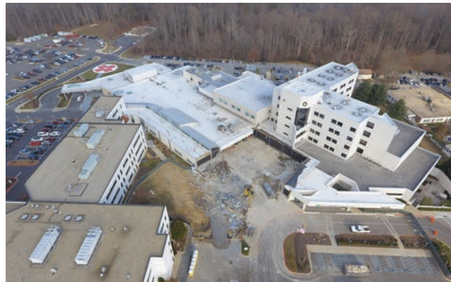
Lower image: What was the main entrance and lobby have been deconstructed to make way for the piles that will support the medical center's new lobby/outpatient concourse and expanded levels two and three.

Follow all the medical center expansion updates! Go to CalvertHealthMedicine.org/ExpansionUpdates for videos and renderings.