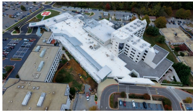
Upper image: An aerial image of CHMC prior to construction.

She said there is ongoing monitoring as part of infection control. “For example, I check all of the