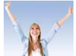
BREAK YOUR TOBACCO HABIT PG 7

Educational and support tools to help you succeed.