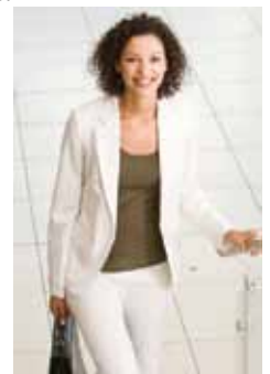
FITTING IN FITNESS PG 6