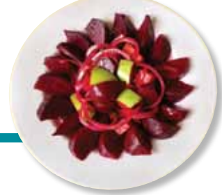
ROASTED BEET SALAD PG 4